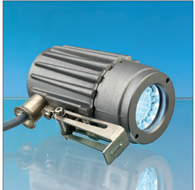
Lumistar luminaire USL 05-LED-Ex