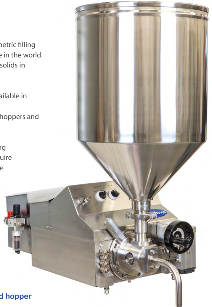
(Below left) heated hopper for hot fills.

These machines are ideally suited to those wanting to start automating a previously manual filling process, and those that don't currently require the output levels offered by a fully automated solution. However, once production demands increase, Response units can be mounted onto an Automation Base to create an extremely flexible fully automatic filling machine.